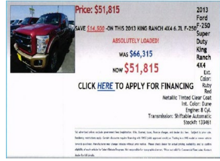
Used 2013 Ford F-250 SuperDuty King Ranch

These terms cannot be used. The ad implies an advertised savings on a used motor vehicle.