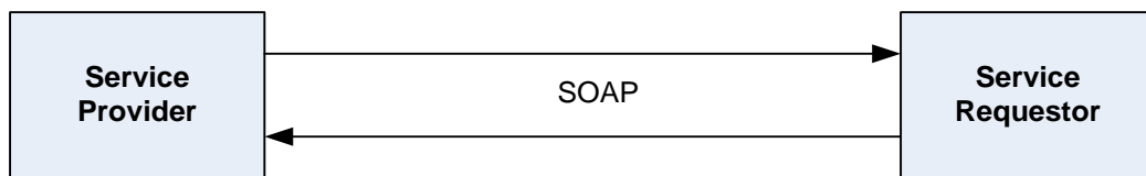
Figure 1: TxDMV Web Services Architecture

The web service uses the SOAP protocol with HTTP for message negotiation and transmission. Any programming language can be used to make requests, and data privacy is ensured via encrypted HTTP. Errors indicating success or failure of a request are explained using standard HTTP response codes, refer to Error Codes .