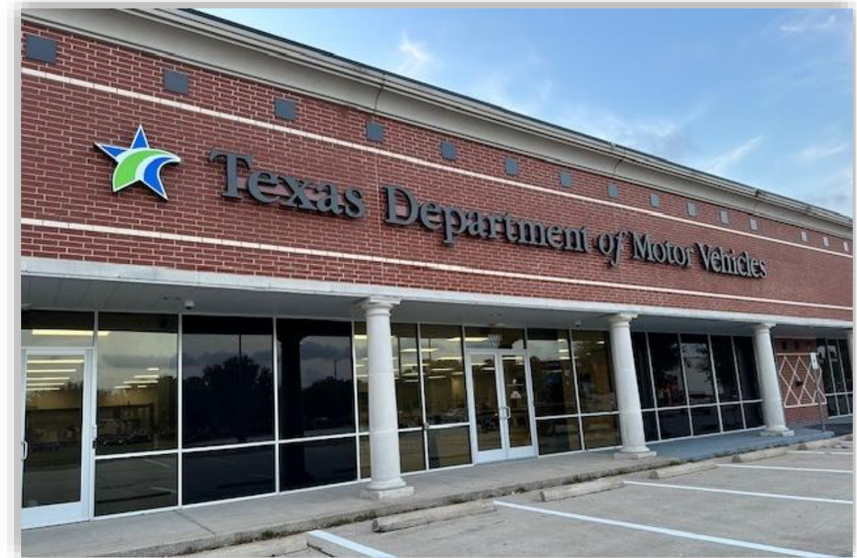
Photo: Houston South Regional Service Center exterior.